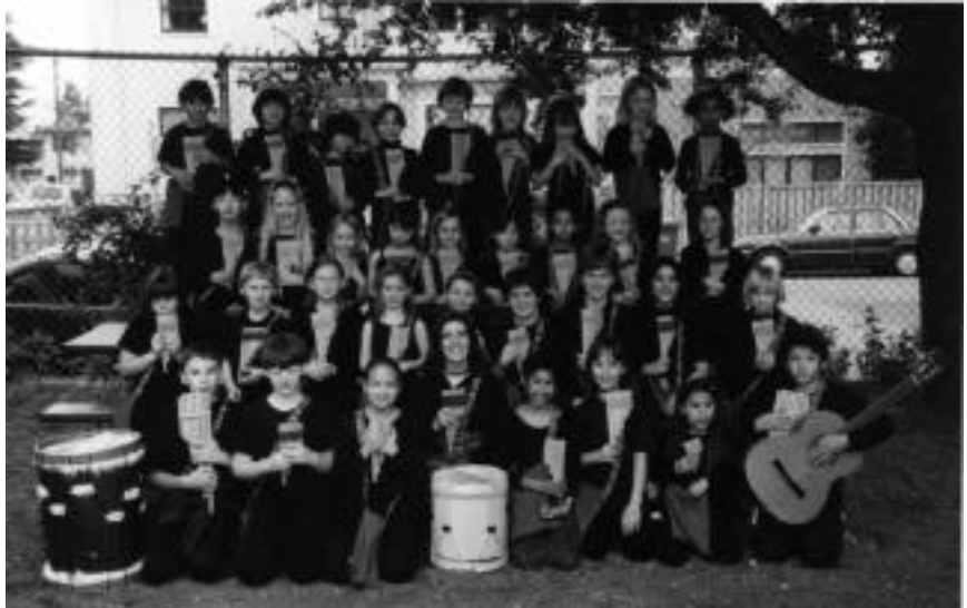
The Latin American ensemble for children, Los Mapaches from Berkwood Hedge School in Berkeley will perform songs and singing games for Lydia Zapana's workshop from 9:30 - 1:00 on October 20 at the Ellen Driscoll Playhouse at 325 Highland Ave. in Piedmont. DON'T MISS IT! (see page 2 for details)